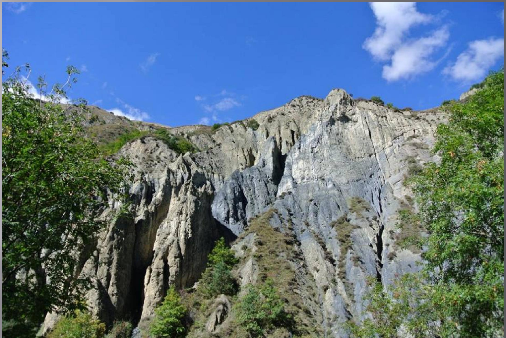
CLIFFS NEAR ANATORI